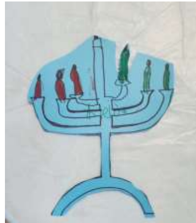
The students drew and colored in a candelabra, which is called a Kinara.