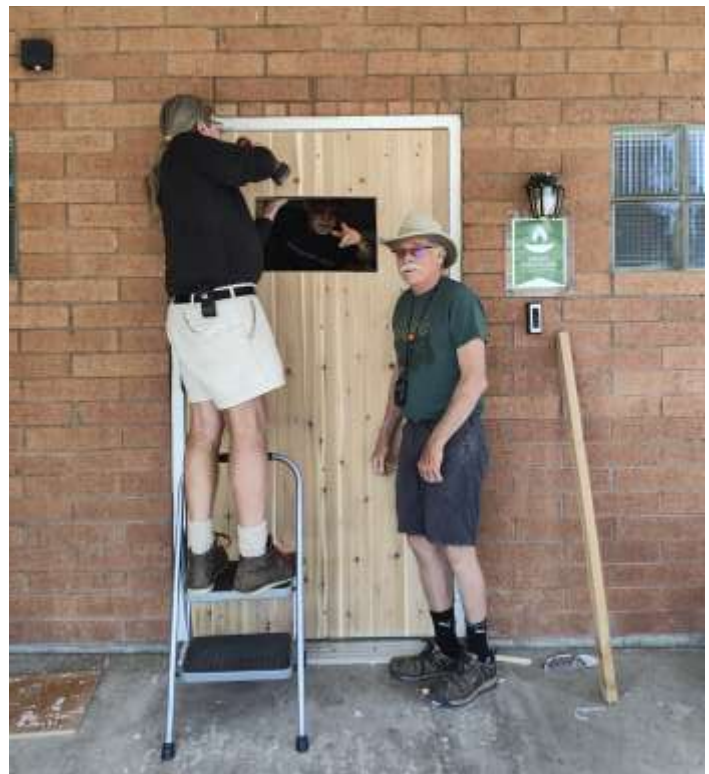
Front Door Renovation Project.